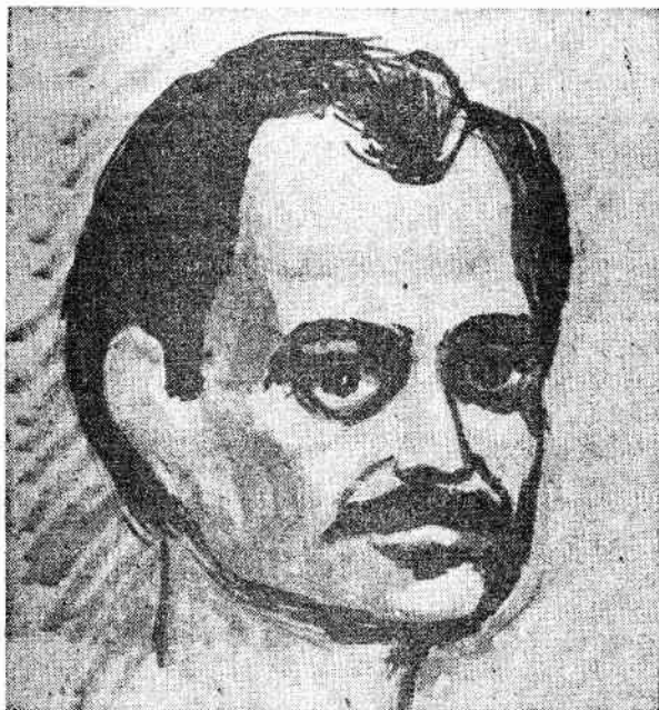
A Self Portrait