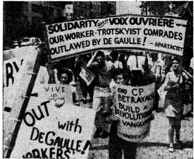
UNITED FRONT New York march on 22 June protests outlawing French revolutionary groups.

The PCF leaders, along with the CGT, their trade union arm, did everything in their power to derail the movement. They attempted to split the initial student-